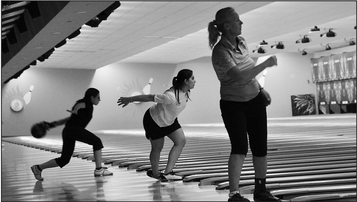
The World Tenpin Bowling Association 2013 World Championships, hosted in Henderson's Strike Zone Bowling Center inside Sunset Station, featured twelve days of competition. The United States took gold in women's doubles, plus men's singles and doubles. South Korea's Seo-Yeon Ryu won gold in women's singles and trios.