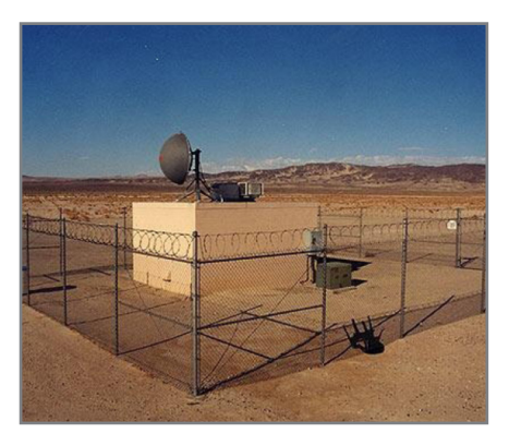
A typical ground electrode control building (About 60 feet by 60 feet fenced area)